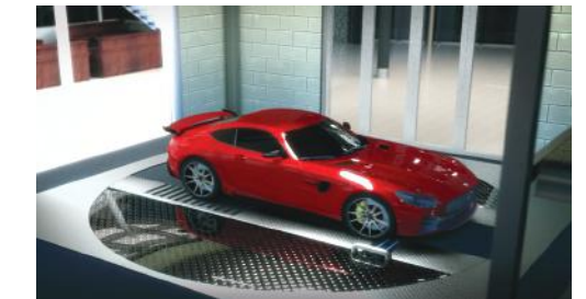
RETRIEVAL: Vehicle is presented to Loading Zone when requested