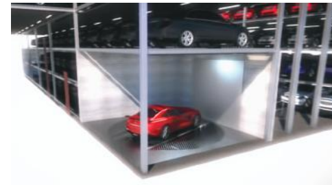
ENTRY: User parks and exits vehicle in Loading Zone

Vehicle is always parked in Loading Zone. Depending on the system, this may be on a parking tray. Rack & Rail Dolly and Shuttle transfer vehicle to and from storage area, or may transfer it to a VRC for storage on another level. User will always park & retrieve car from Loading Zone/s.