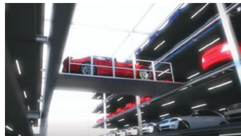
STORAGE: Vehicle is automatically parked by Rack & Rail System